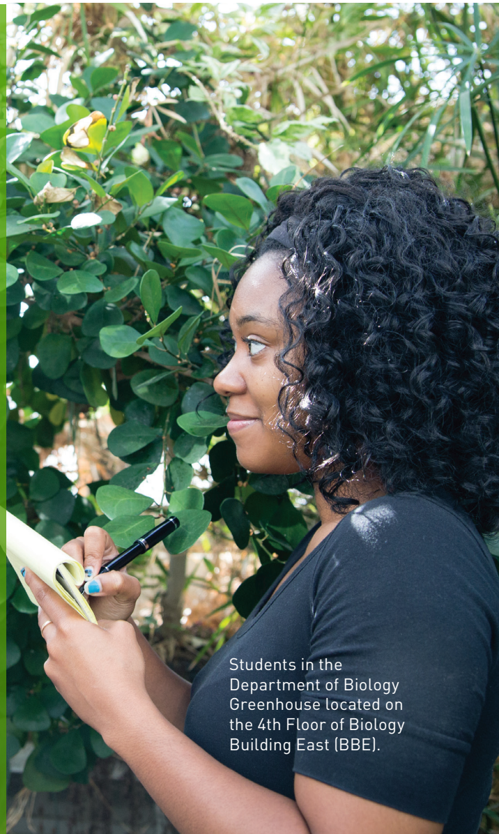
Students in the Department of Biology Greenhouse located on the 4th Floor of Biology Building East (BBE).